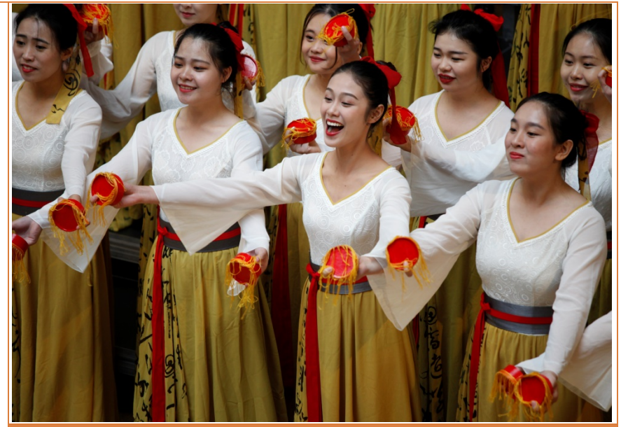
CATEGORY B - DIFFICULTY LEVEL II

• For pieces 1-3 only original compositions may be performed.