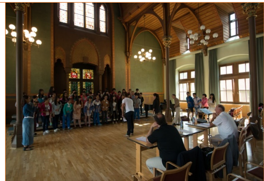
EVALUATION PERFORMANCE for competing choirs

Accompaniment: unlimitedTotal time: 45 minutes