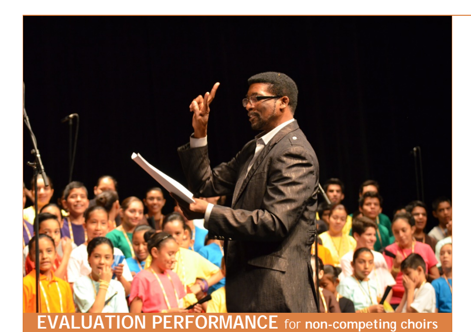
• three (3) pieces of the choir's choice