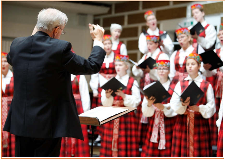
CATEGORY A - DIFFICULTY LEVEL

A1- Mixed Choirs; A2- Equal Voices (Male and Female Choirs)