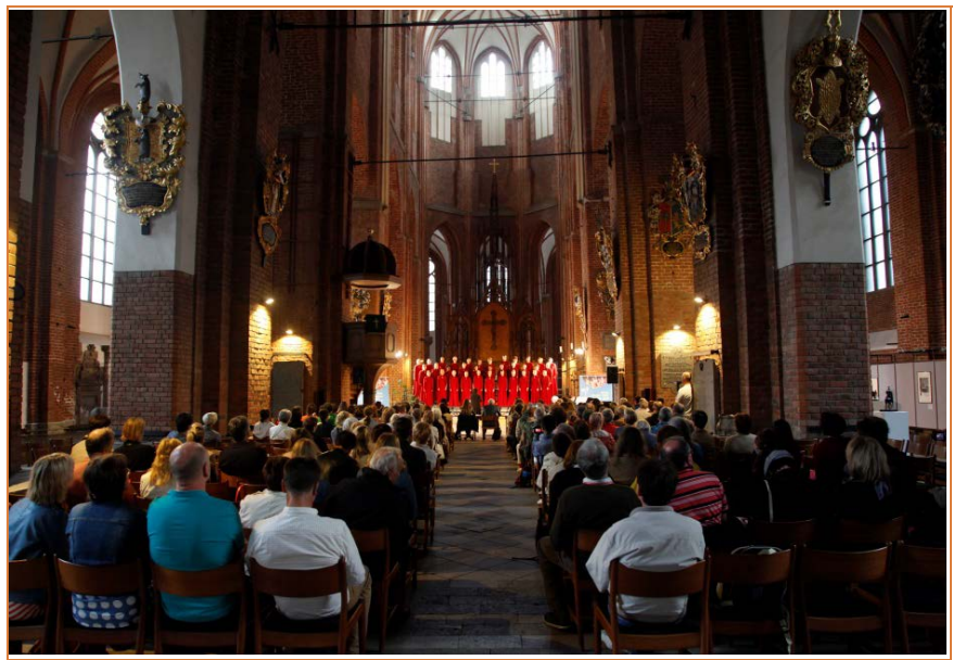
CATEGORY S - SACRED CHORAL MUSIC A CAPPELLA

Three (3) pieces of Christian sacred music of the choir's choice have to be performed.