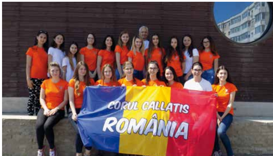
CORUL DE COPII "CALLATIS" Mangalia, Rumunjska / Romania