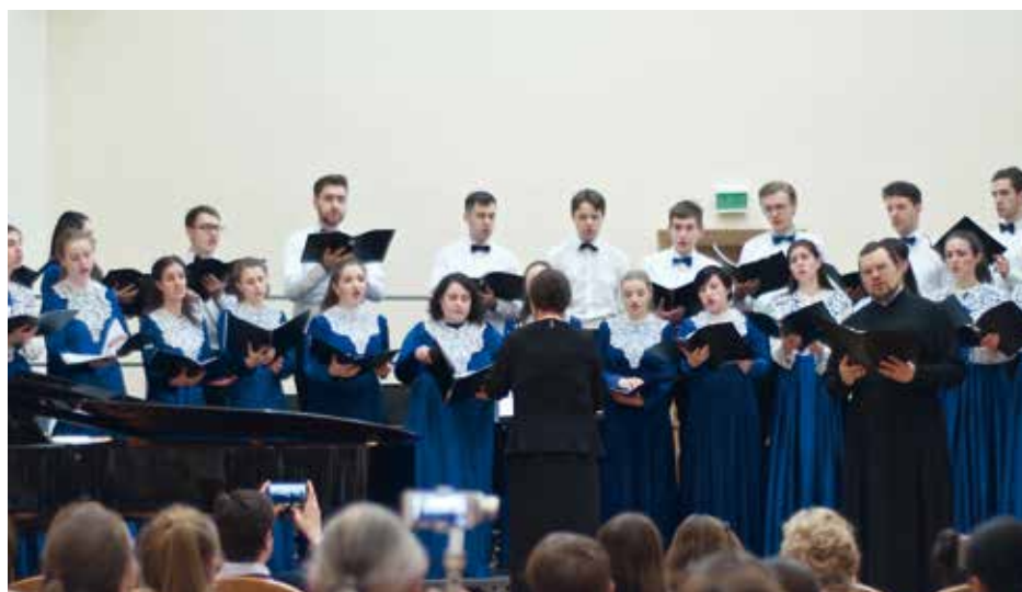
KHOR "MOSKOVSKIYE KOLOKOLA" Moscow, Rusija / Russia