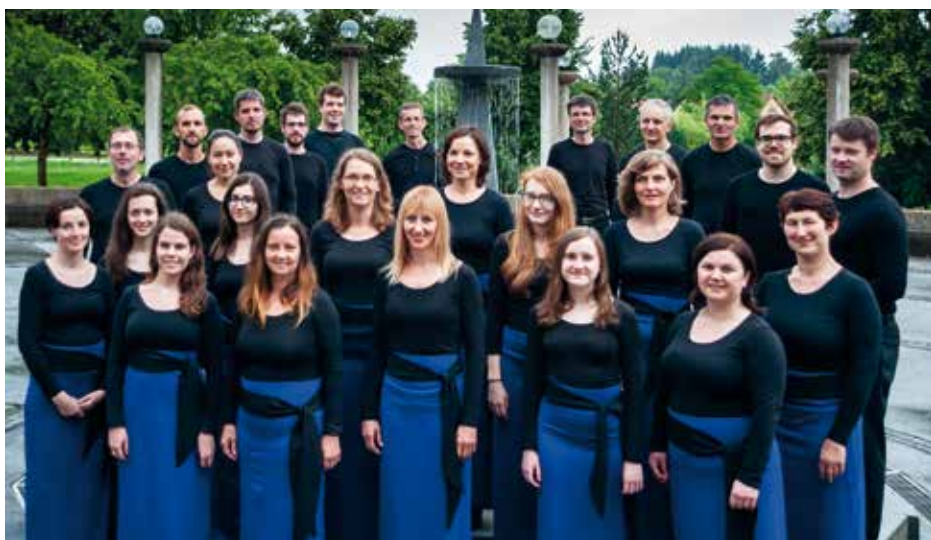
COLLEGIUM VOCALE CELJE Celje, Slovenija / Slovenia