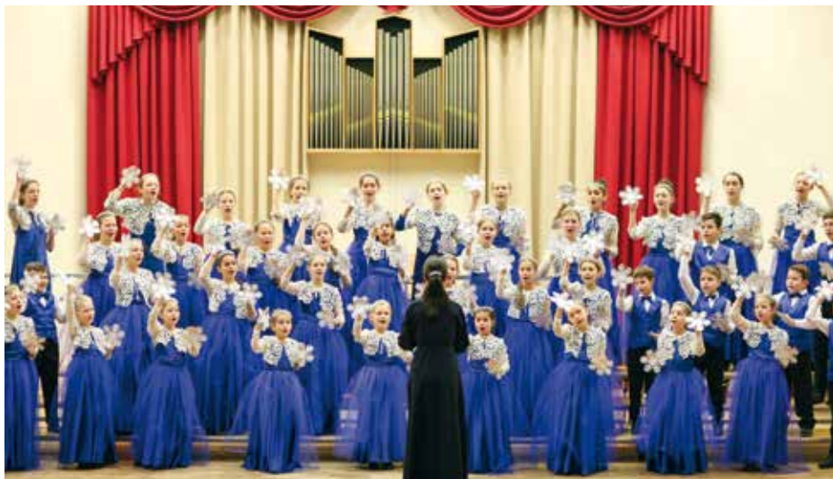
KHOR "MOSKOVSKIYE KOLOKOLCHIKI" MUSYKAL'NOY SHKOLY GNESINYKH Moscow, Rusija / Russia